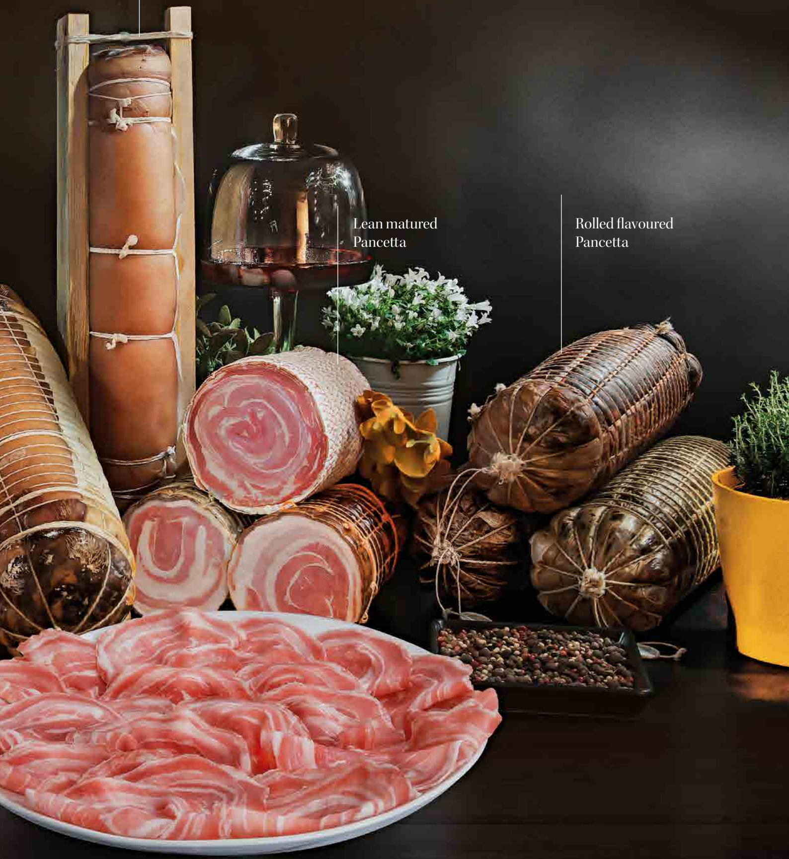
Rolled flavoured Pancetta