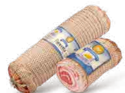
Rolled Pancetta without rind