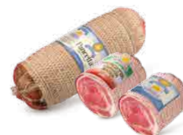
Lean Pancetta coppata