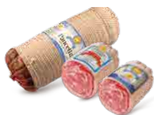
Pancetta coppata defatted 4 kg