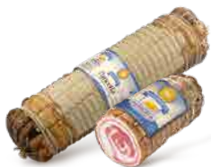
Rolled Pancetta with rind