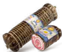
Matured rolled Pancetta without rind with flavourings

Whole Vacuum packed, whole Vacuum packed, in halves