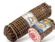
Matured rolled Pancetta without rind with pepper

Whole Vacuum packed, whole Vacuum packed, in halves