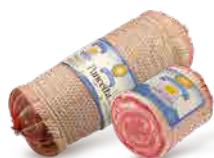
Lean matured Pancetta