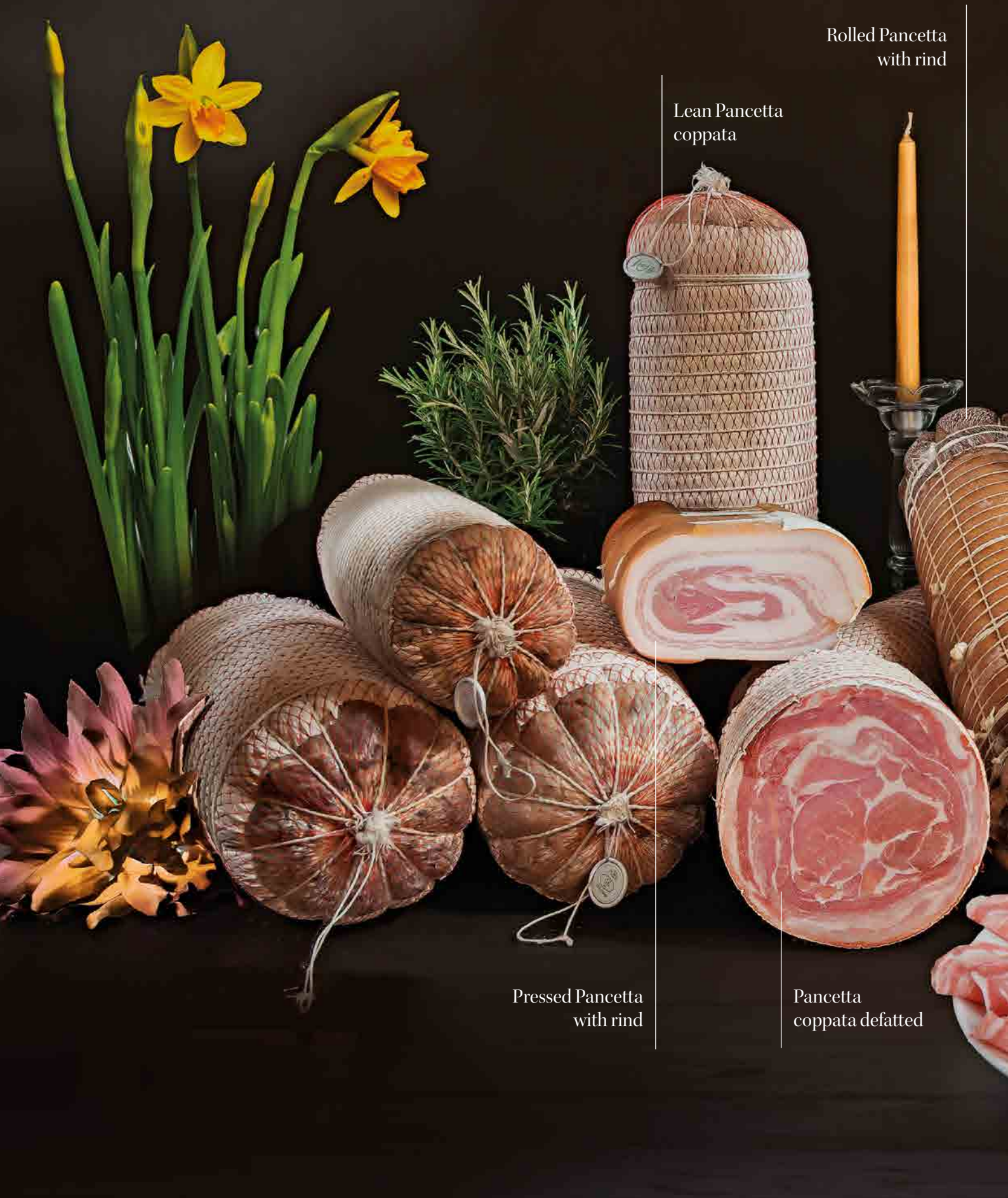
Pancetta coppata defatted